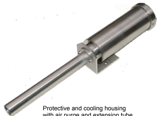
Protective and cooling housing with air purge and extension tube