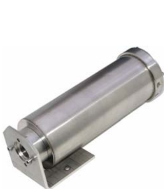
Protective and cooling housing WK15